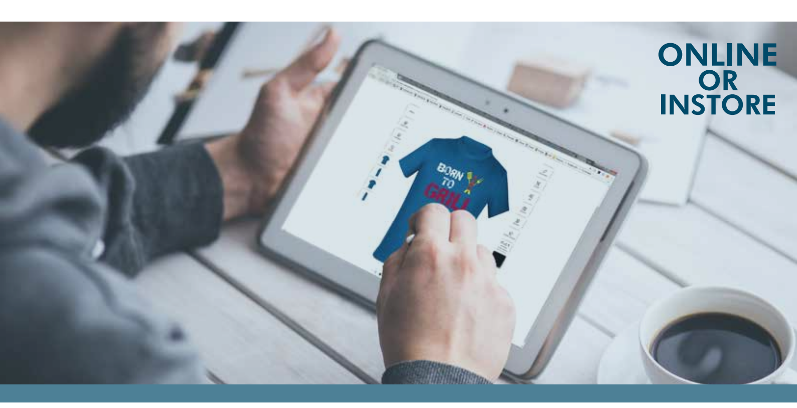
Create you own Shop.